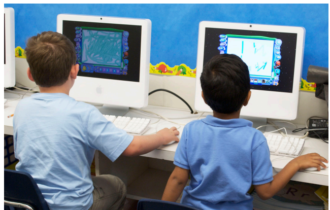
Computers are in every classroom at Chadwick School where I work, including the kindergarten shown here.

Los Angeles Zoo Fun Zone ( http://www.lazoo.org/fun/ ) - This is the home for online learning and games at the L.A. Zoo.