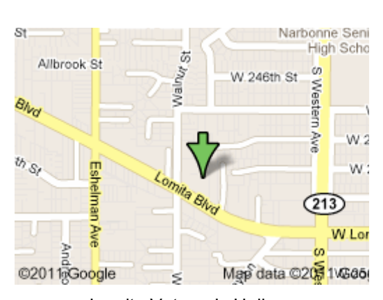
Lomita Veteran's Hall, 1865 Lomita Blvd, Lomita

Members, friends and colleagues are invited to attend our monthly meetings. The $35 membership annual dues entitle you to receive this monthly newsletter by mail or online. plus many more benefits (page To become a 8). member or get more info please check our website.