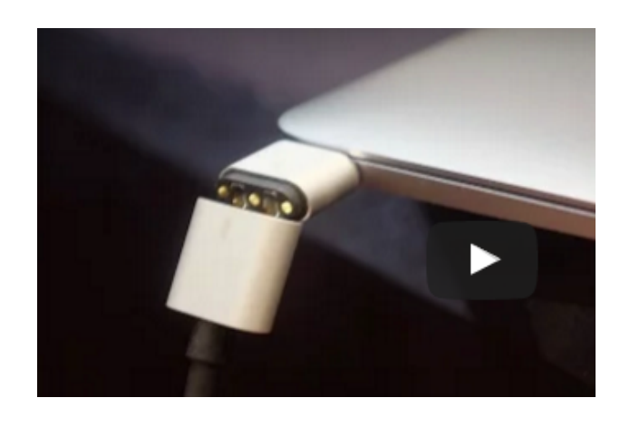
will be out in April for $39.99

The cable works as promised, plugging in firmly to the MacBook's USB-C port and detaching easily under pressure. You could definitely leave the adapter in your laptop most of the time, though of course you then wouldn't be able to plug anything else in. Unless you plugged the adapter into an adapter, of course. One other quirk of the BreakSafe connector is that, unlike regular USB-C, it's not actually reversible — you can blame magnets and polarity for that one. The BreakSafe cable