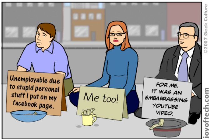
Signs of the social networking times.

Newseum ( http://www.newseum.org/ ) blends high-tech with the historical. It's actually a 250,000-square-foot museum of news — offering visitors an experience that blends five centuries of news history with up-to-the-second technology and hands-on exhibits. The Newseum in reality is located at the intersection of Pennsylvania Avenue and Sixth Street, N.W., Washington, D.C., but the link above allows you to visit the Newseum virtually.