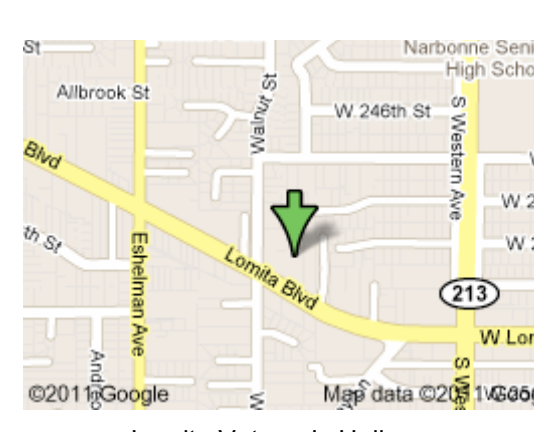
Lomita Veteran's Hall, 1865 Lomita Blvd, Lomita

Members, friends and colleagues are invited to attend our monthly meetings. The $35 membership annual dues entitle you to receive this monthly newsletter by mail or online, plus many more benefits (page To become a 8). member or get more info please check our website.