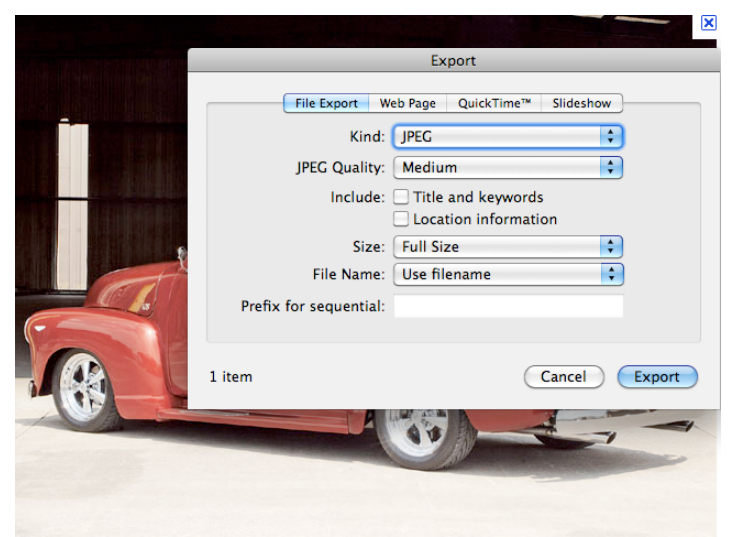
Fig. 01. Exporting an image

Learn how to compress an image to create a small file for uploading to a web site or sending via email. You can use iPhoto's export function for this. Go to Export under the File menu and you find this, fig. 01, and choose quality and size.