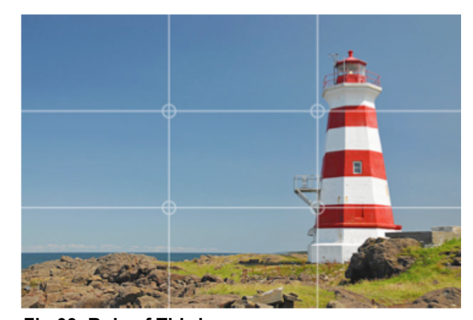
Fig 03. Rule of Thirds

The basic principle behind the rule of thirds is to imagine breaking an image down into thirds (both horizontally and vertically) so that you have 9 parts, fig. 03.