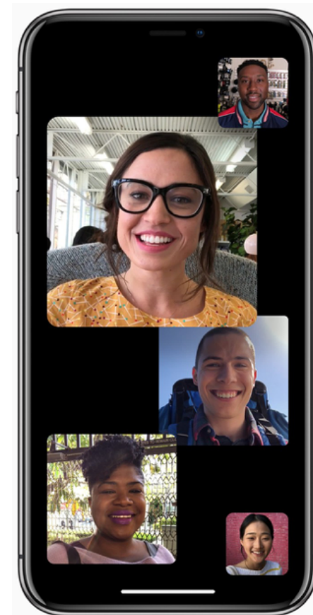
On an iPhone