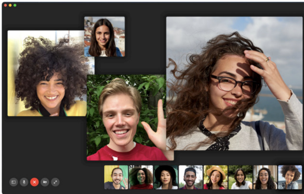
On a Mac