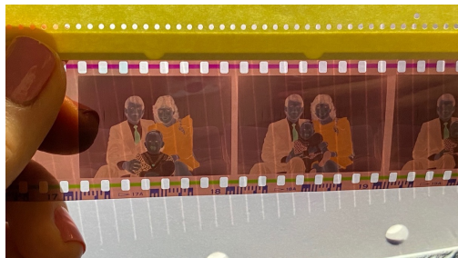
Negative Viewed Normally is Hard to View

The problem is that negatives are very hard to judge with the colors inverted. For some reason our brains simply can’t swap the colors in our heads. I have no idea how he thought of this idea, but he figured out how to use an iPhone or iPad to view negatives in their proper colors. Open Settings, Accessibility, Display and Text Size and find the setting entitled Classic Invert. Toggle it on. Your iOS device will now look very weird, but if you launch the Camera app and pretend you’re going to take a photo of the negative, you’ll be able to see the negative with the colors just as they would be if you printed it. I completely understand why this works but it’s still crazy to see it actually work!