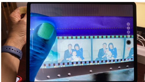
Negative Viewed Through iPad Camera with Inverted Colors Looks Normal