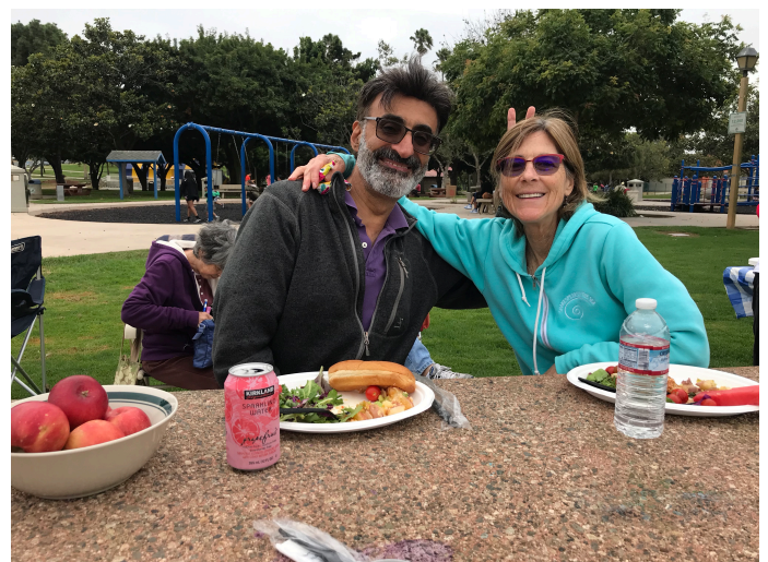
Your Newsletter Editor & Picnic Coordinator