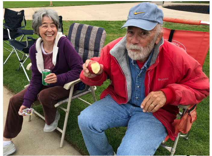
Is this the start of a new Apple logo?!!!