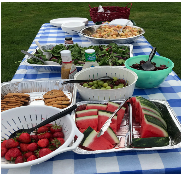
Food & drinks courtesy of the club!