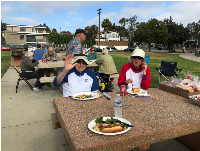
Howdy! Did you see the back of their shirts?