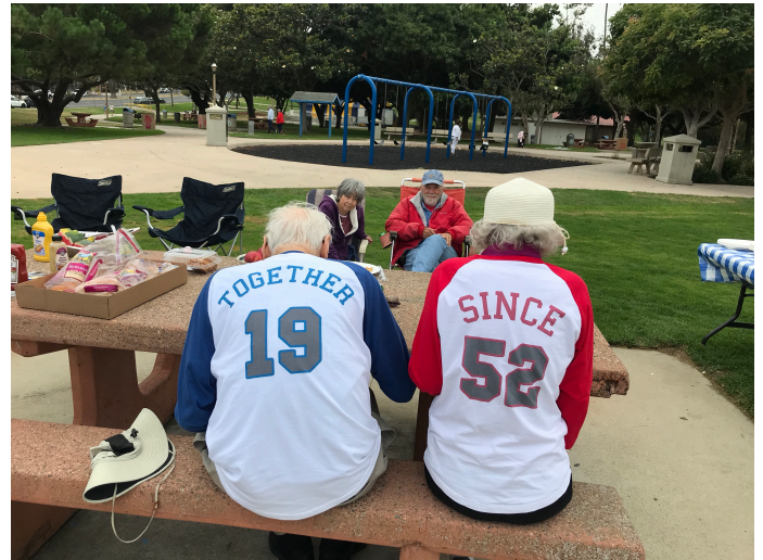
Happy 70th anniversary to these picnickers!