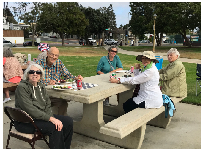
Nice to see our Club President at the picnic!