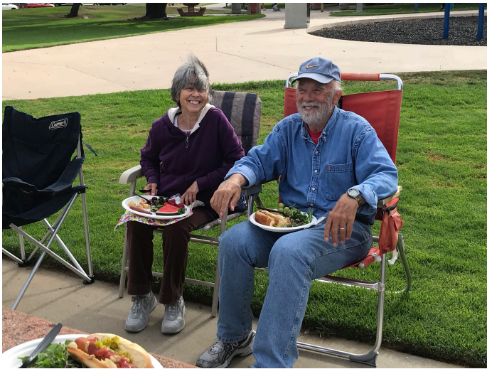
Ready to enjoy some good eats!