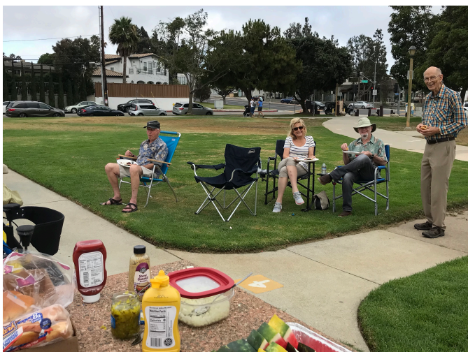
Perfect time for a picnic!