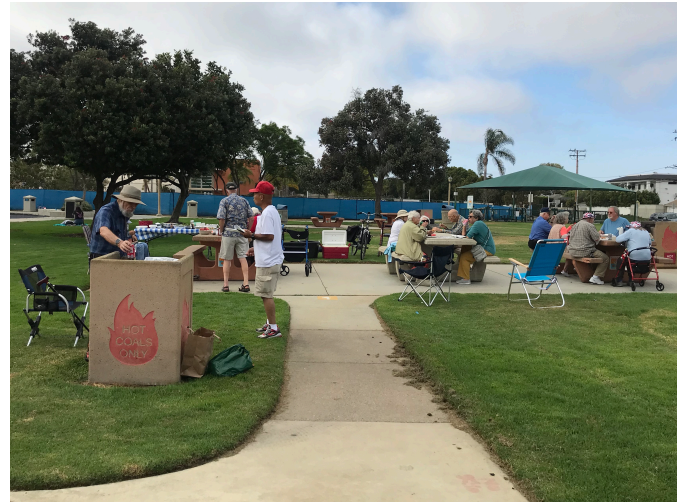
We had a nice picnic area with three big tables and our own BBQ. Room for extra chairs, too.