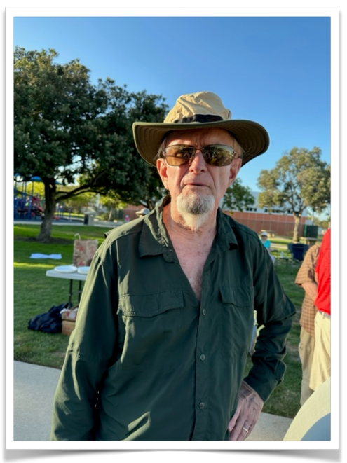
That sun is bright!