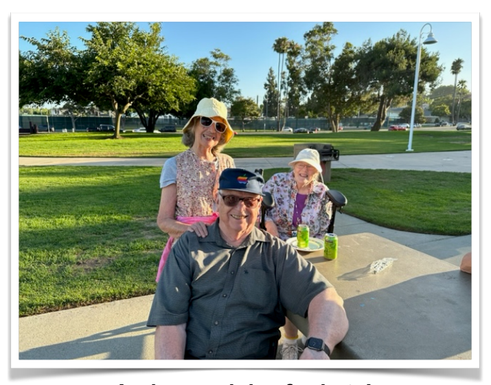
And a good day for hats!