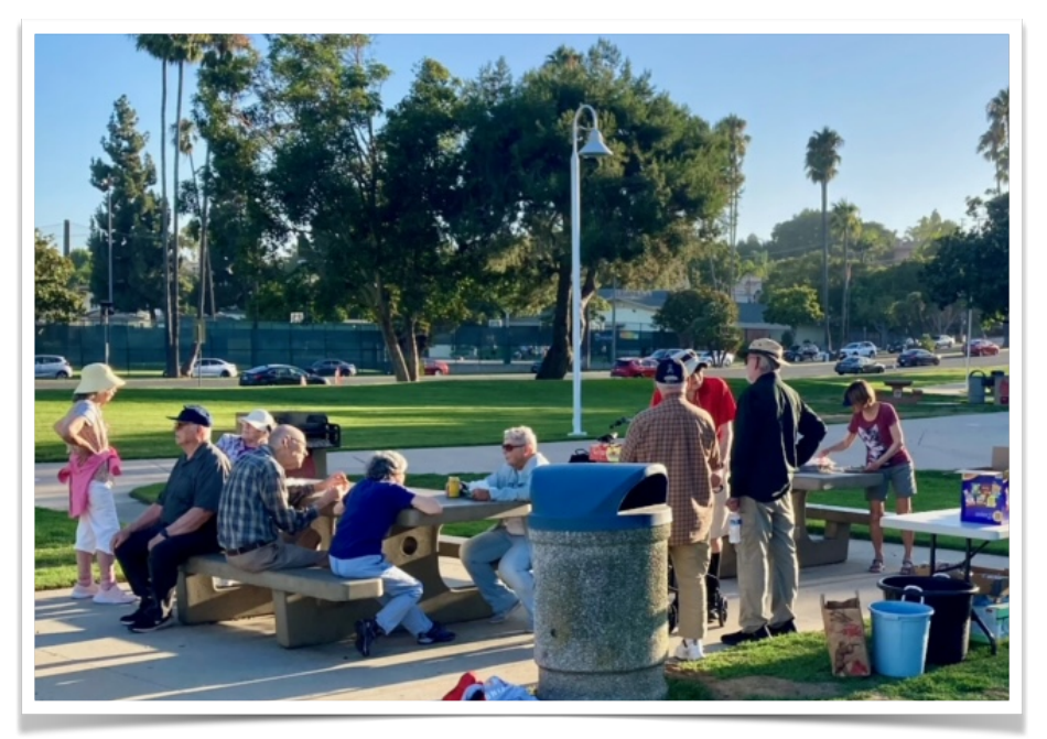
So nice to catch up with each other in person!