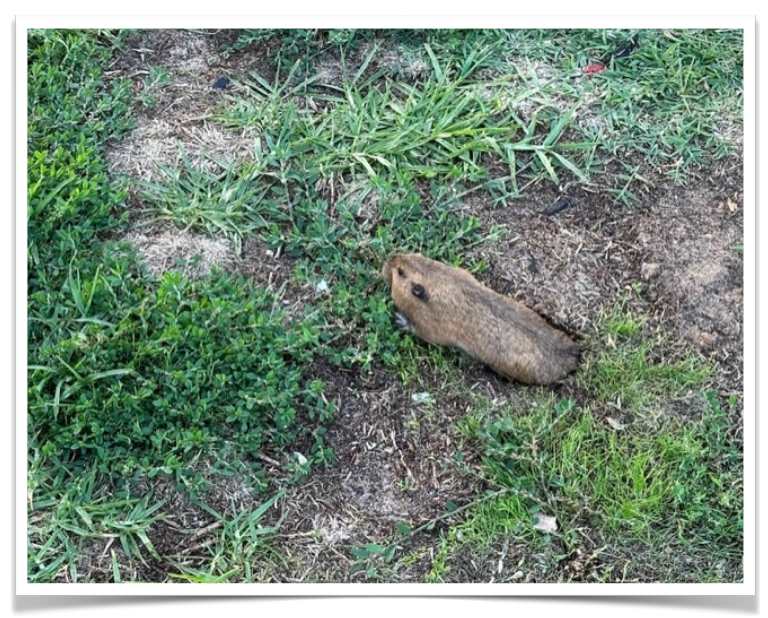
We had a surprise guest!