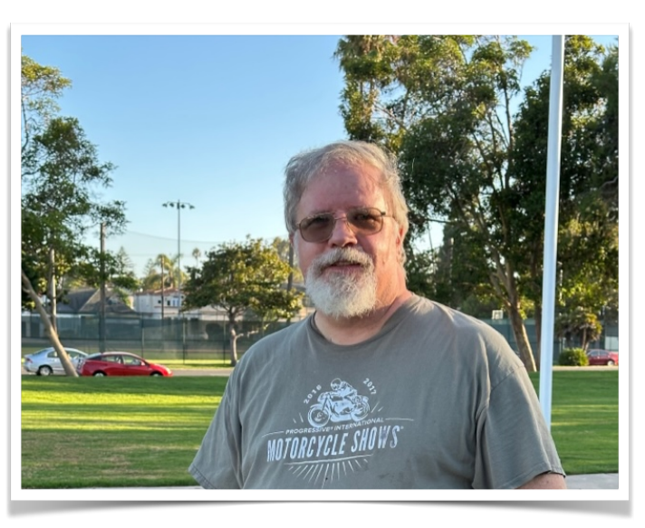
Love your cat cartoons, Jim!