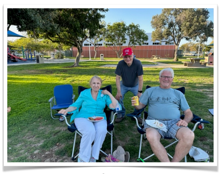
It was a beautiful day at the park!