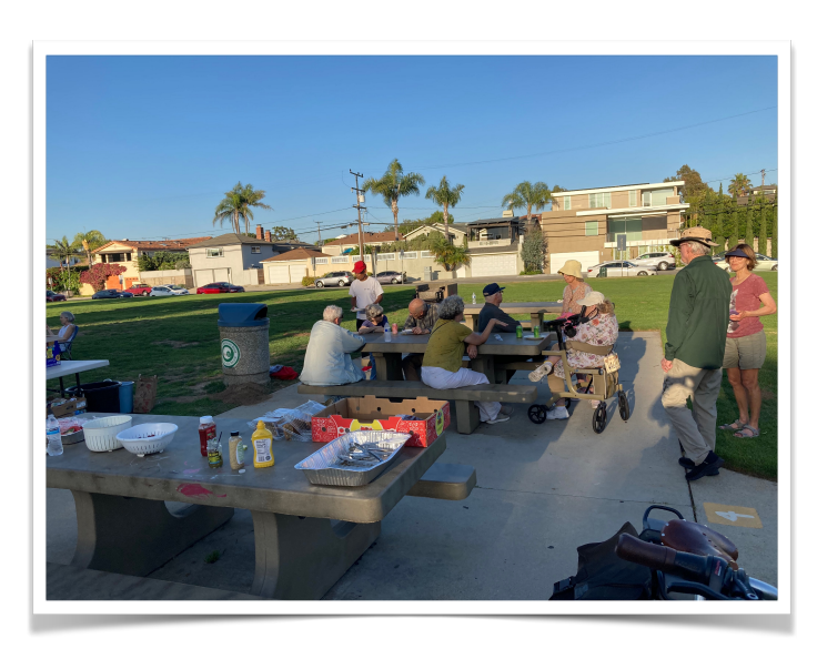
I can't believe we ate the whole thing!